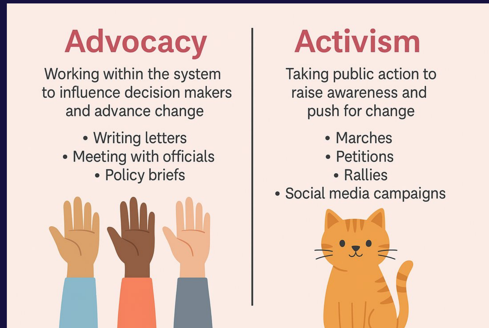
Figure 1 Advocacy vs. Activism [Diagram]. From Advocacy vs. Activism , by Grammar Stammer, 2025. Retrieved August 13, 2025, from https://grammarstammer.weebly.com/words-to-the-wise/advocacy-vs-activism